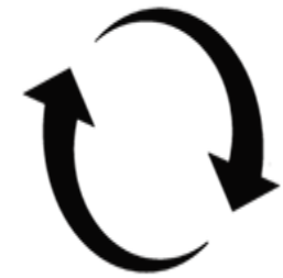
Change and Development