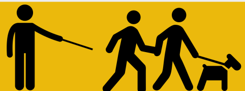
Walking his/her/their dog