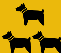
There are a few/some dogs