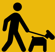
Walking my dog