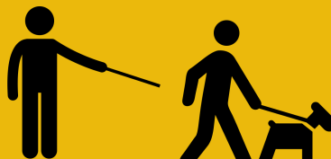
Walking your dog