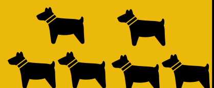
There are a lots of dogs