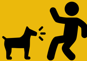
An angry dog