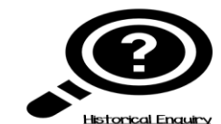
Historical Enquiry Learn where to find historical sources, how they can be used and the validity of them.